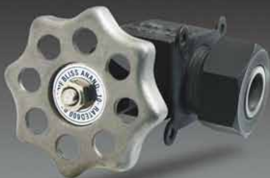
Series 10 Valve