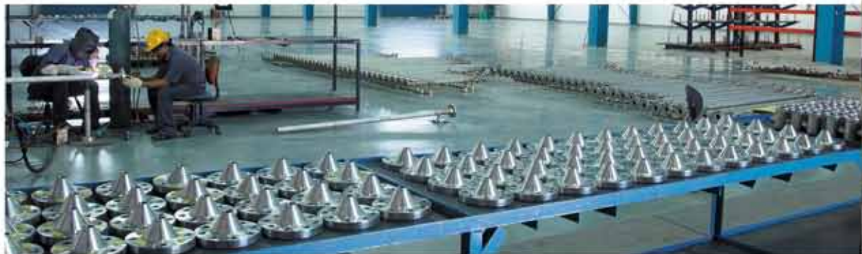
WELDING FACILITY - I