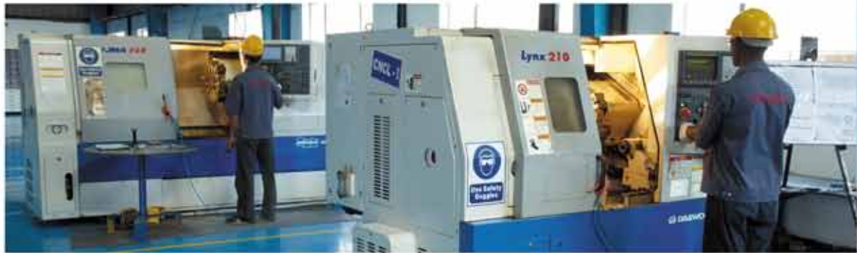
CNC SHOP FLOOR