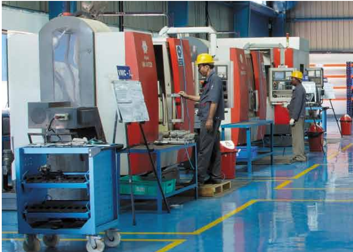
CNC Shop Floor, Bawal (Haryana, India)